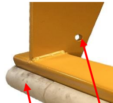
Changeable rubber pads