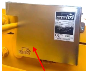
Shield for locking system