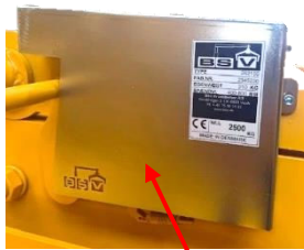
Shield for locking system