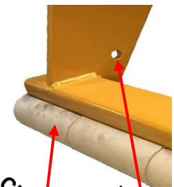
Changeable rubber pads